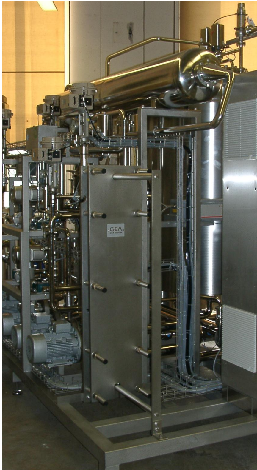
Figure (Example DIMIX-C™ Qmax. 7,000 l/h)