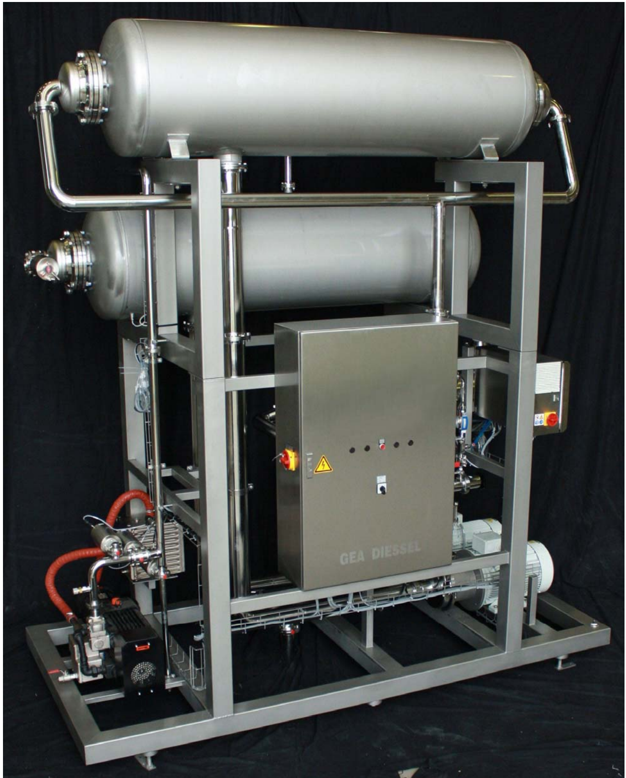
Figure (Example DIOX-2T™: Qmax. 300 hl/h)