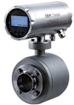
Fig.: with an optional welding socket

By default the IZMAG™ is delivered in compact all-in-one design (see the image on the right). A separated version can be optionally supplied.