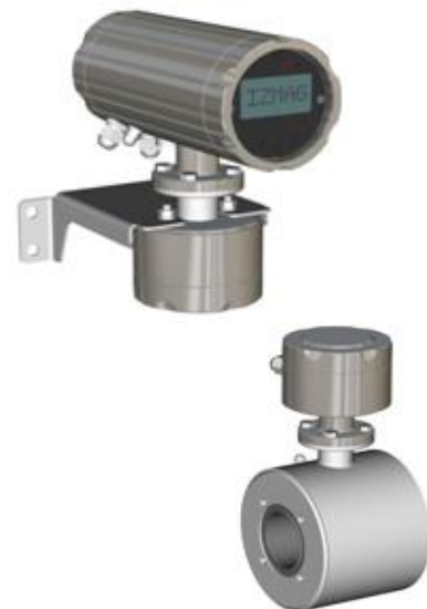
Fig.: the IZMAG™ in separated design

By default the IZMAG™ is delivered in compact all-in-one design. A separated version can be optionally supplied (see the image on the right).